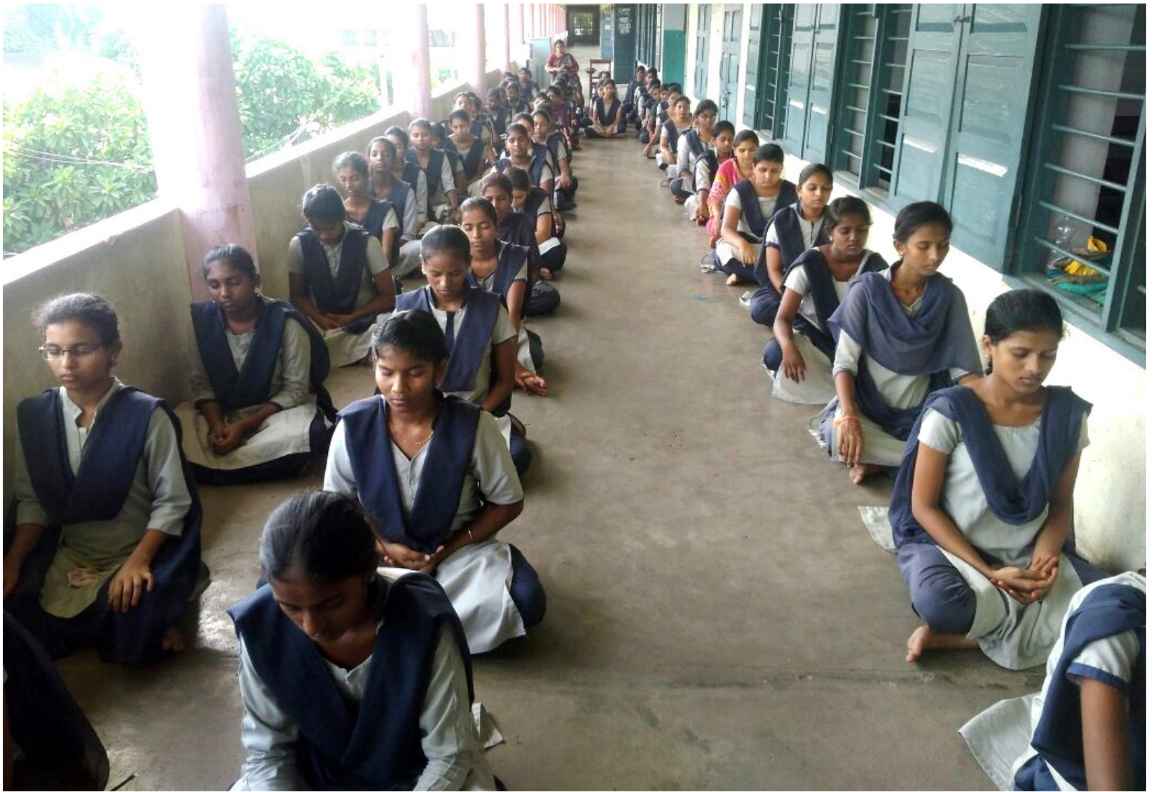
Montessori Mahila Kalasala, Vijayawada - 200 students Dt: 4th August 2018