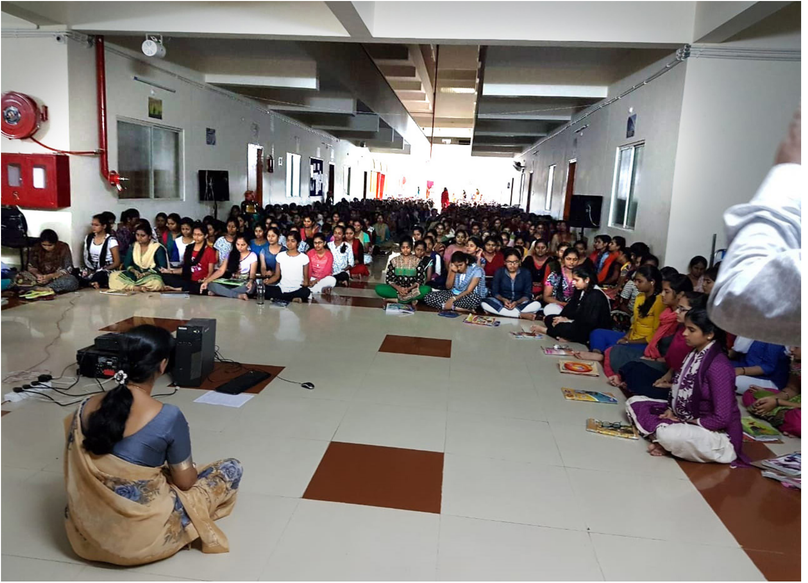
Narayana Junior College, Tirupati - 925 students Dt: 12th August 2018