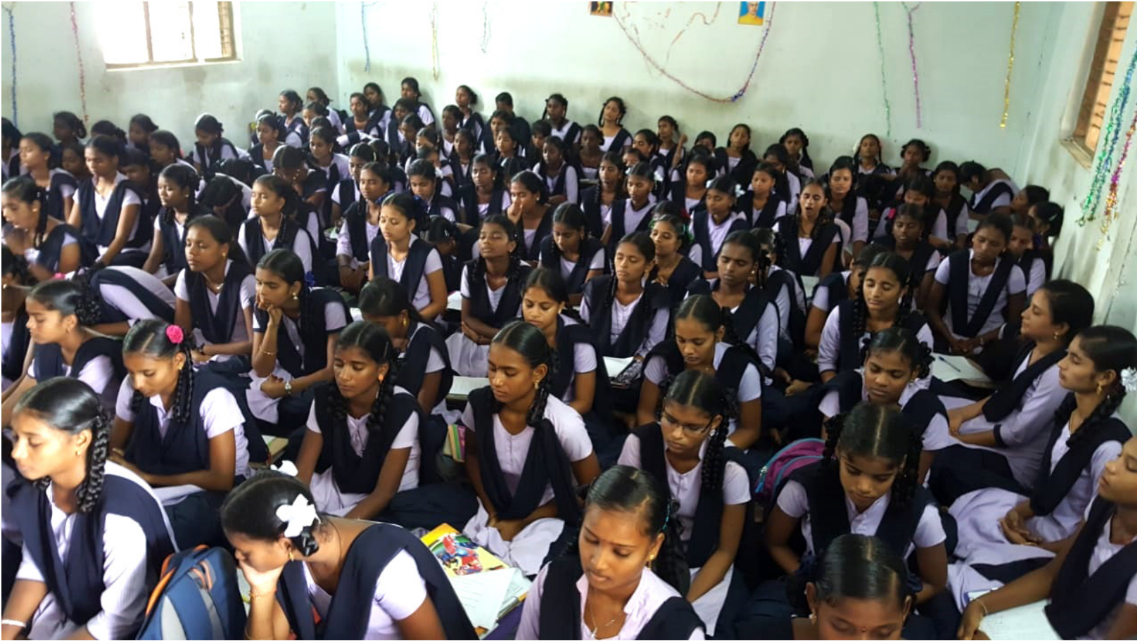
Government Junior College, Girls, Srikakulam - 1250 students Dt: 20th August 2018