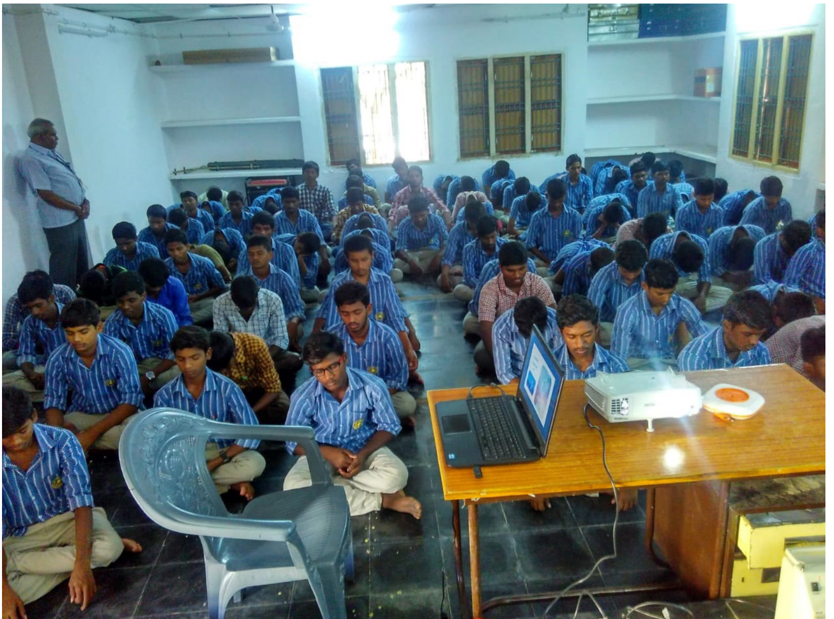
Government Junior College, Vemula - 45 students Dt: 20th August 2018