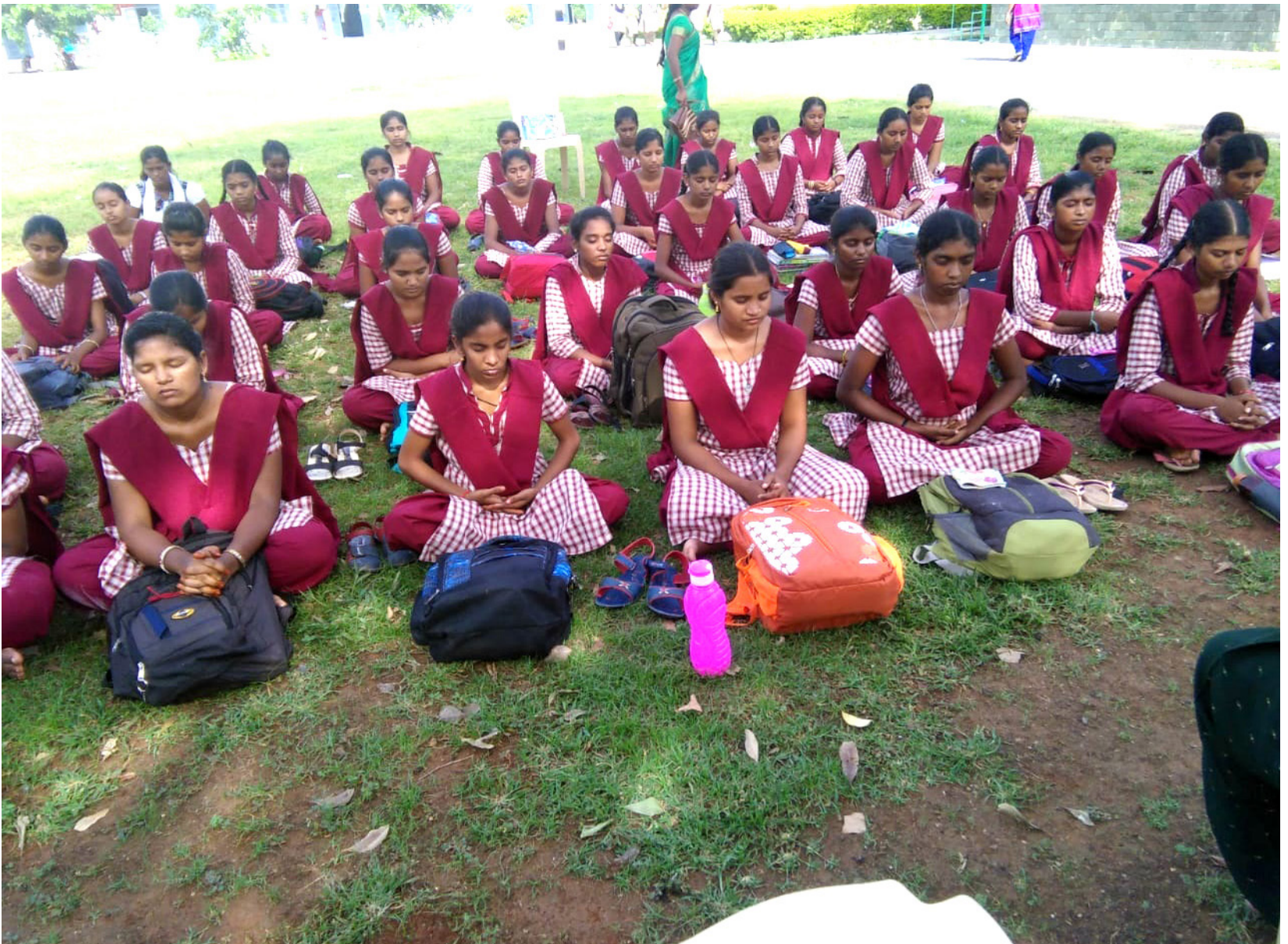
JMJ Junior College, Tenali - 200 students Dt: 4th August 2018