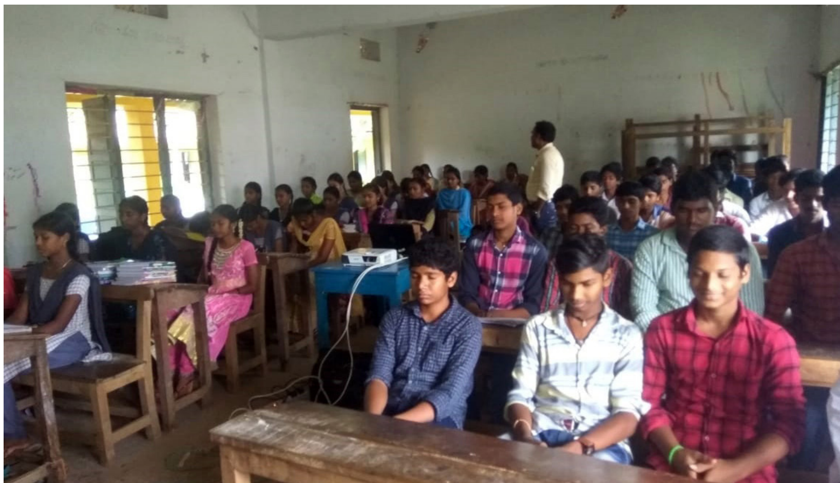
SNVR Government Junior College, Inavilli - 100 students Dt: 11th August 2018