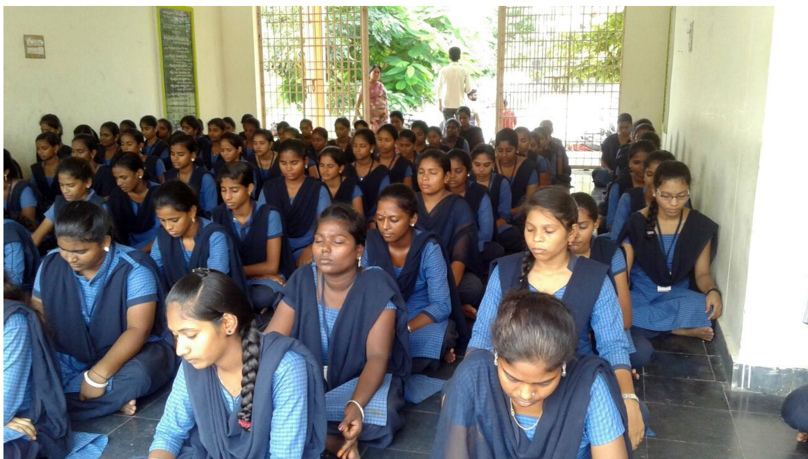
Government Junior College, Gajapathipatnam - 260 students Dt: 23rd August 2018