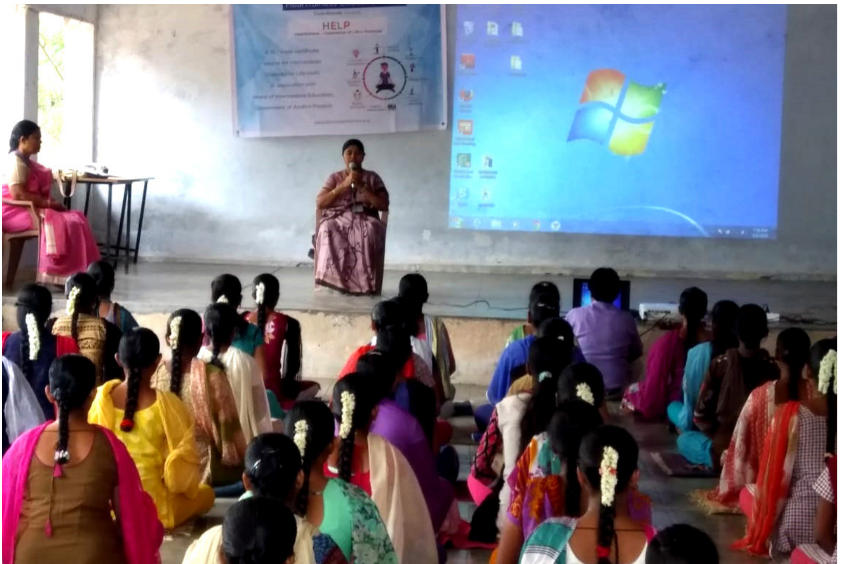
APTWR College for Girls, Kadiri - 124 students - Dt: 7th August 2018