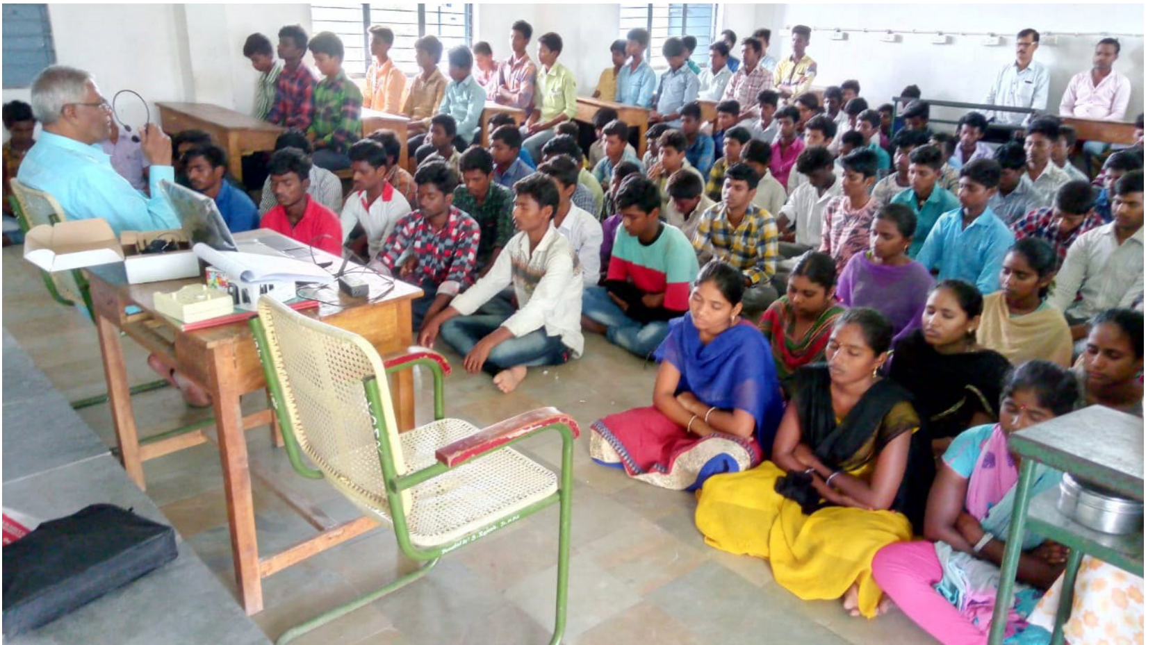
Government Junior College, Kodumur - 200 students Dt: 3rd August 2018