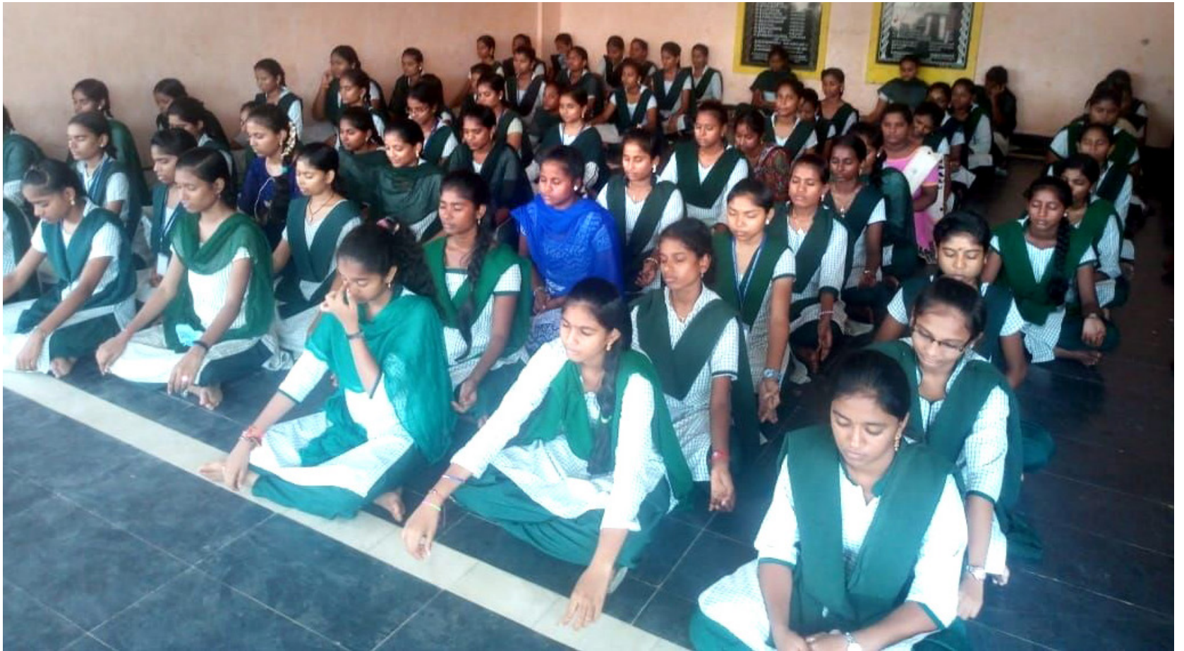
Government Junior College, Krishnalanka, Vijayawada - 140 students Dt: 4th August 2018