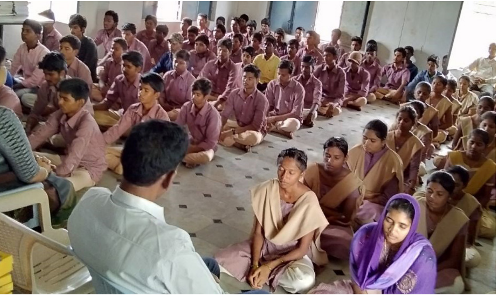
Government Junior College, Kalakada - 190 students Dt: 3rd August 2018