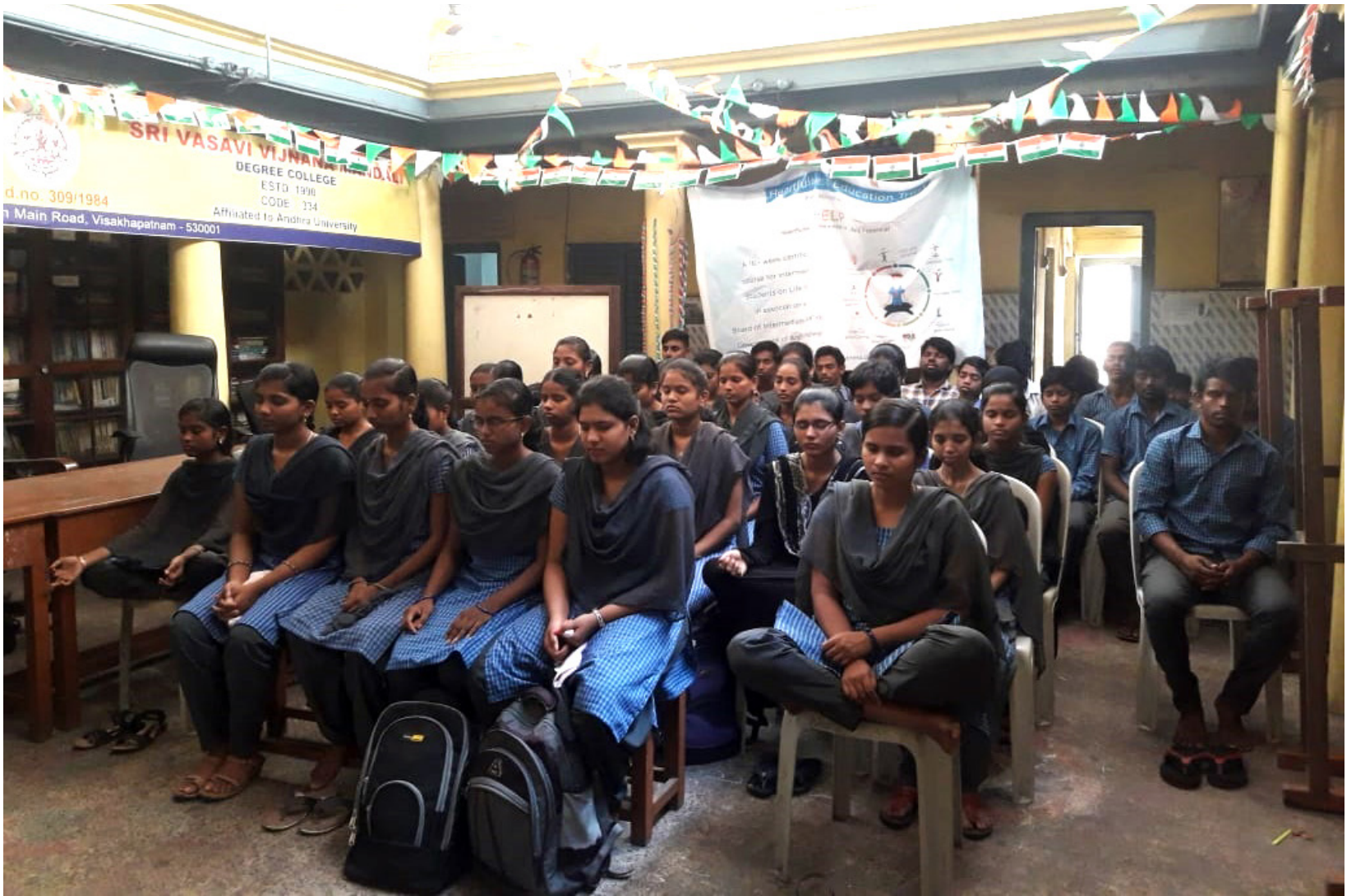
Alwardas Junior College, Visakhapatnam - 256 students Dt: 7th August 2018