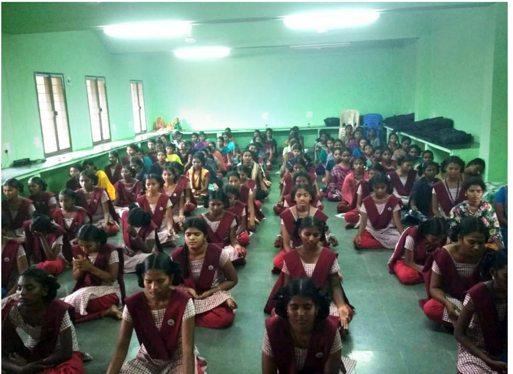
Master's Junior College, Kurnool - 180 students Dt: 3rd August 2018