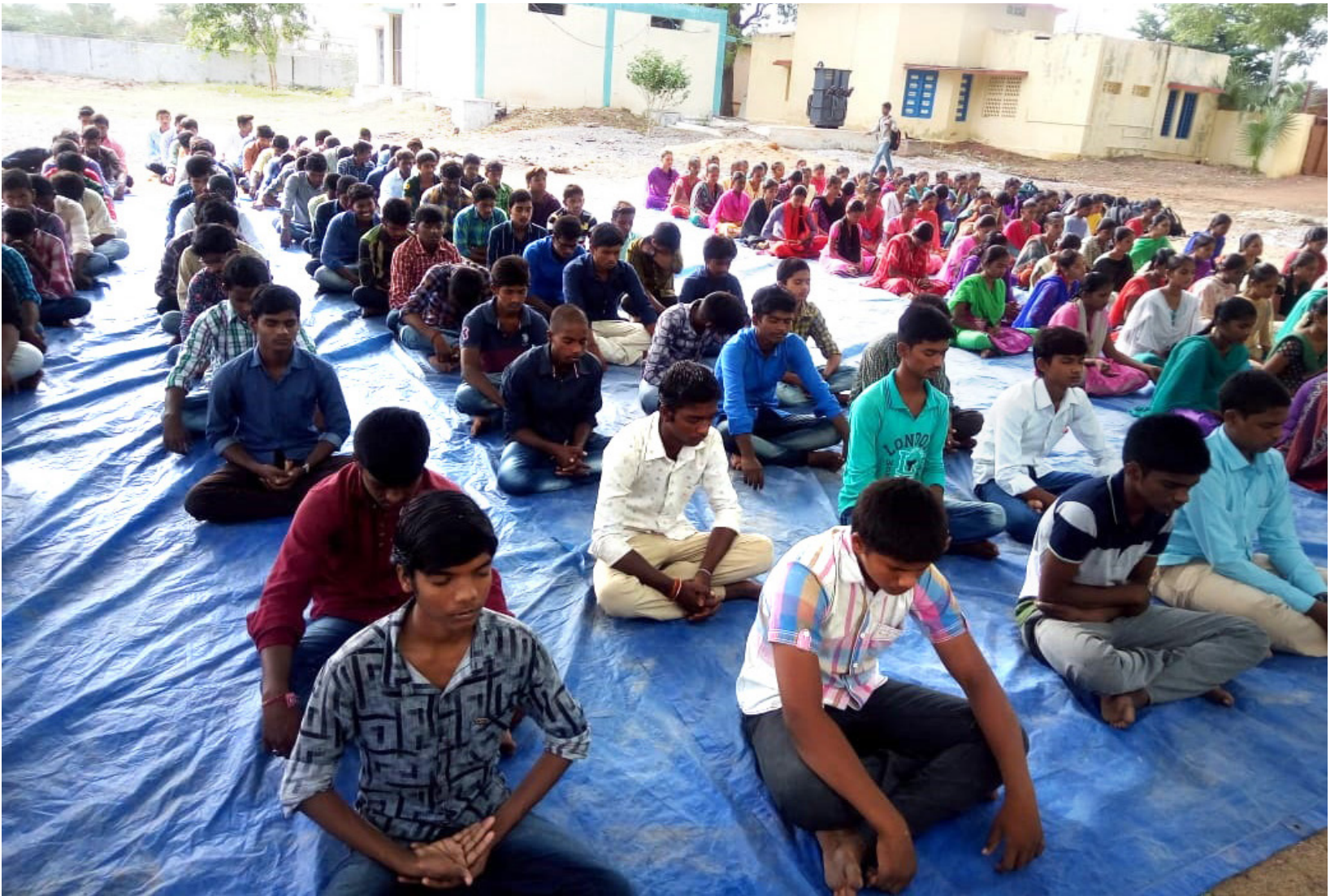
Government Junior College, Pendimarrri - 180 students Dt: 8th August 2018