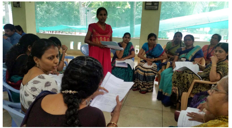
Training Session at Visakhapatnam Heartfulness Centre - 21st & 22nd July 2018