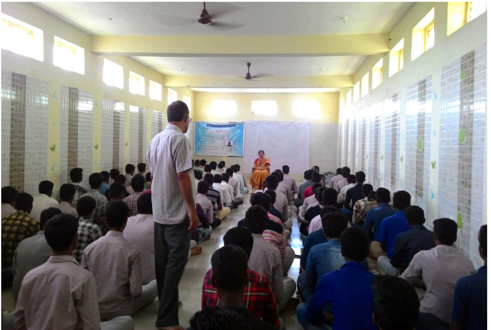
Bluemoon Junior College, Kadiri - 303 students - Dt: 23rd August 2018