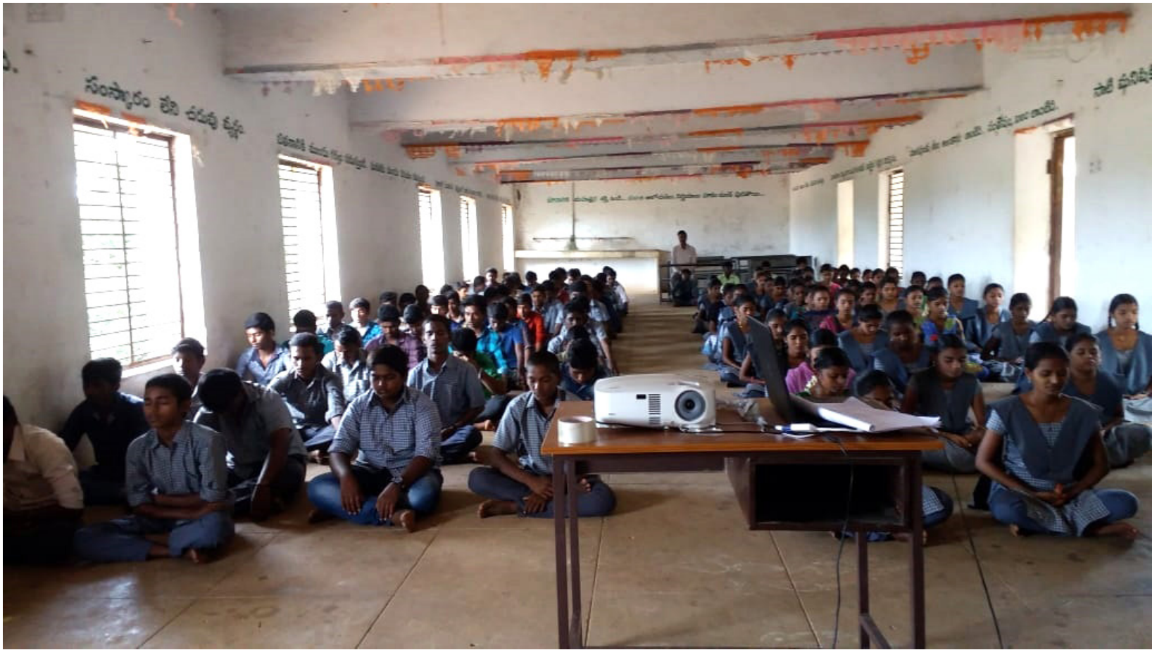
Government Junior College, Rly Koduru- 170 students Dt: 20th August 2018