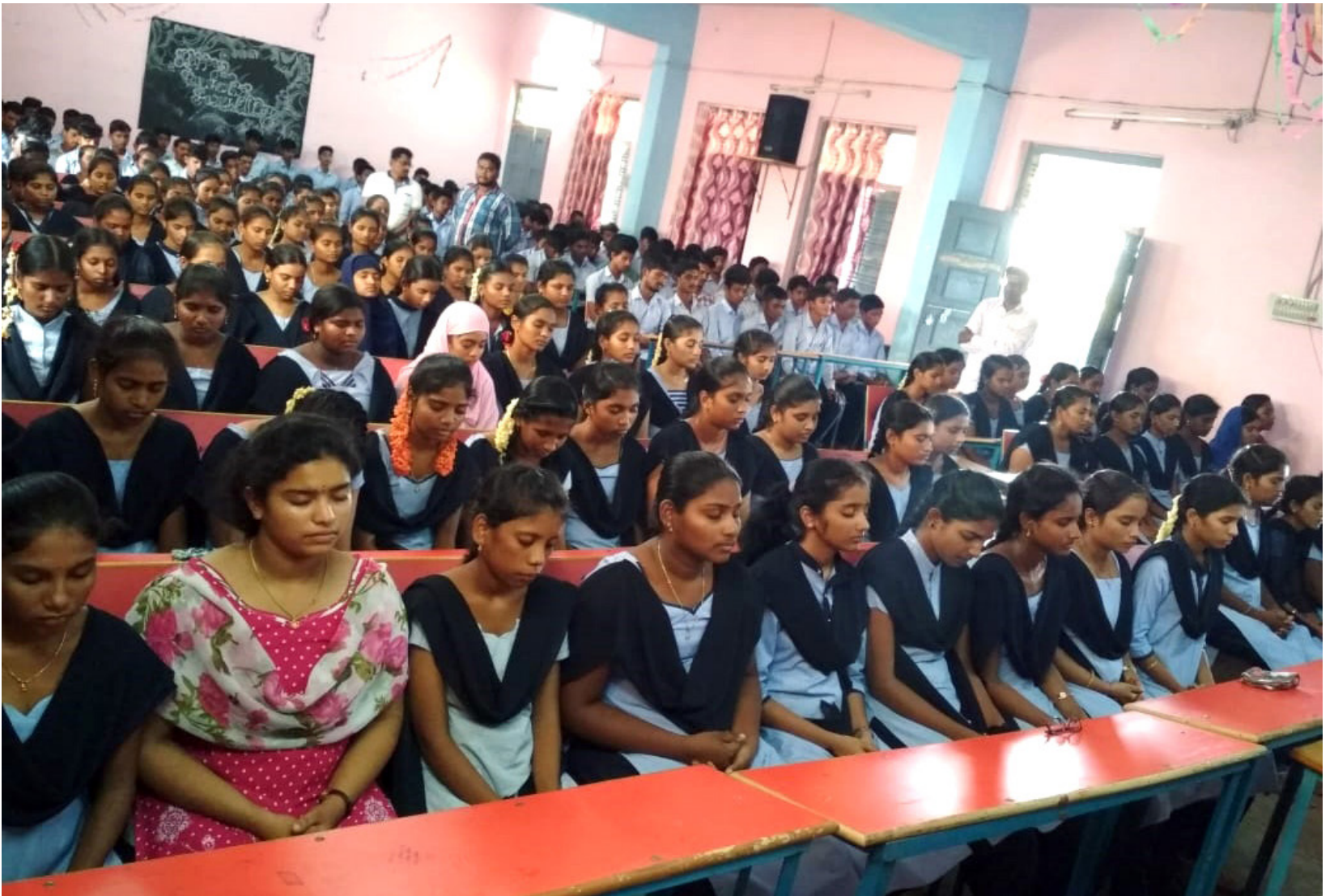
St. Mary's Junior College, Bucchireddypalem - 395 students Dt: 6th August 2018