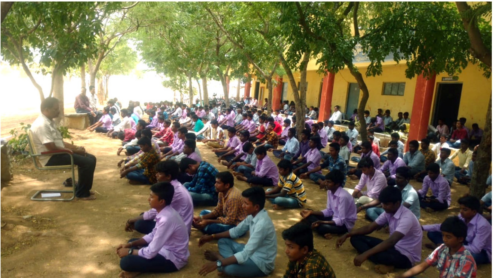
B R Government Junior College, Punganur - 106 students Dt: 20th August 2018