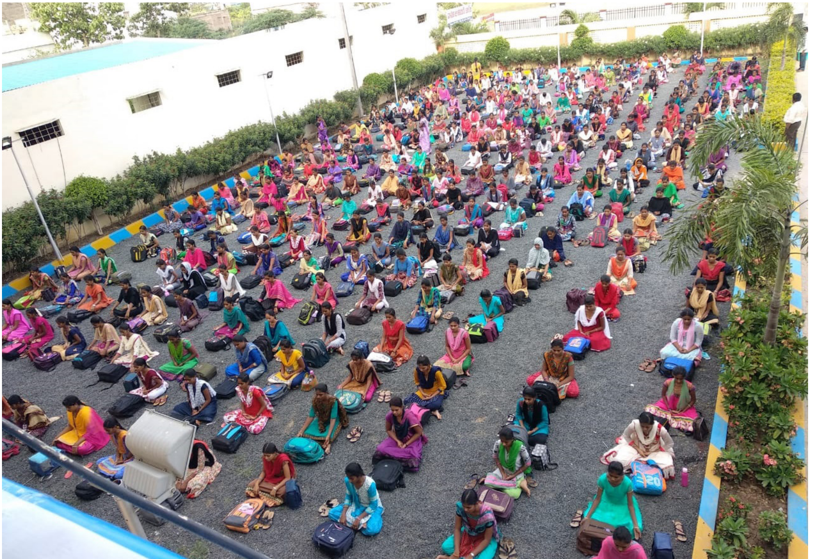
Sri Vasavi Junior College, Cumbum - 677 students Dt: 4th August 2018