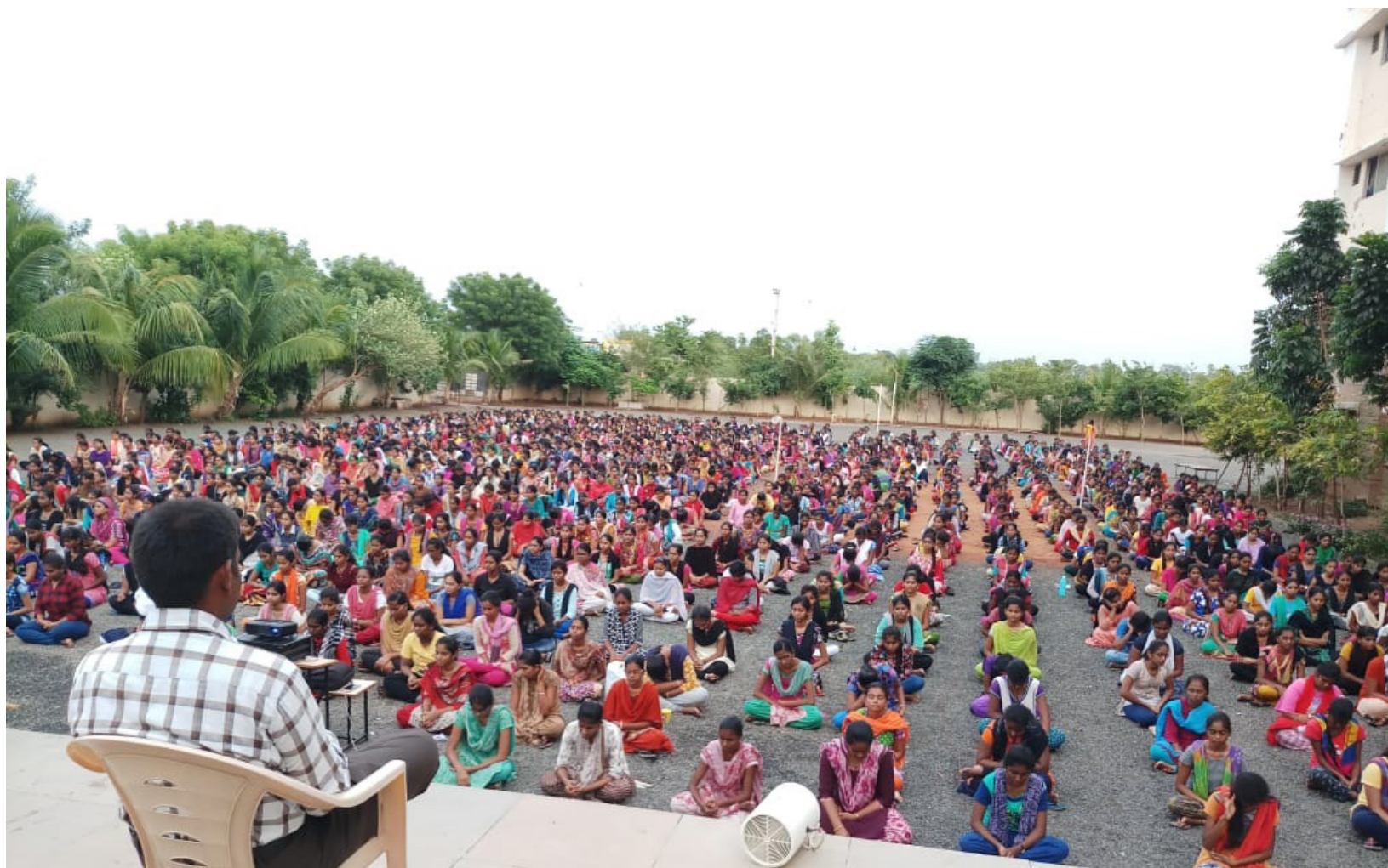
Narayana Junior College(Girls), Kurnool - 1400 students Dt: 5th August 2018