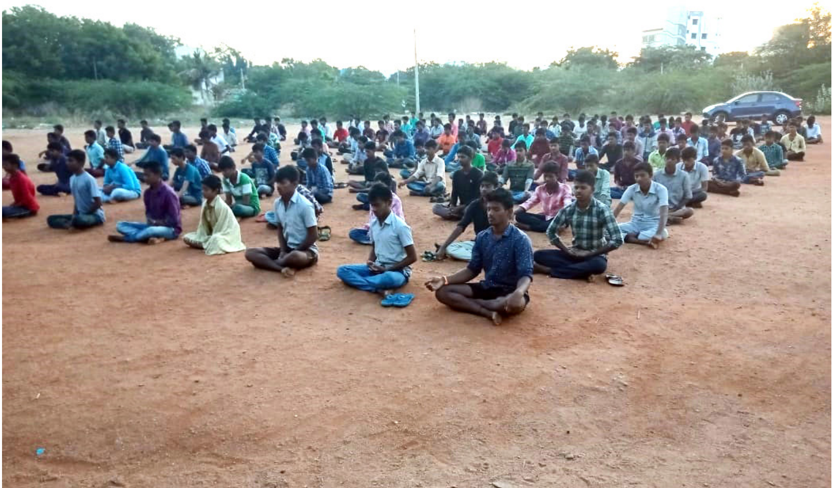
SV Junior College, Kowlepalli - 116 students - Dt: 23rd August 2018