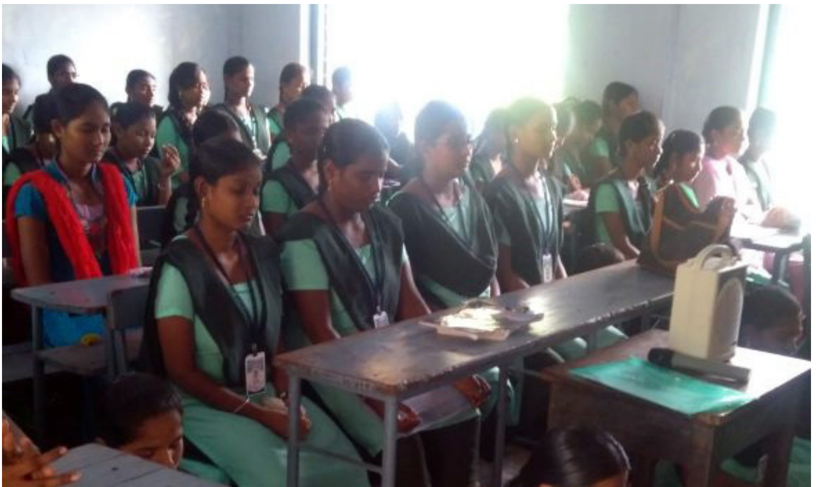
Bishop Azariah Junior College, Vijayawada - 90 students Dt: 6th August 2018