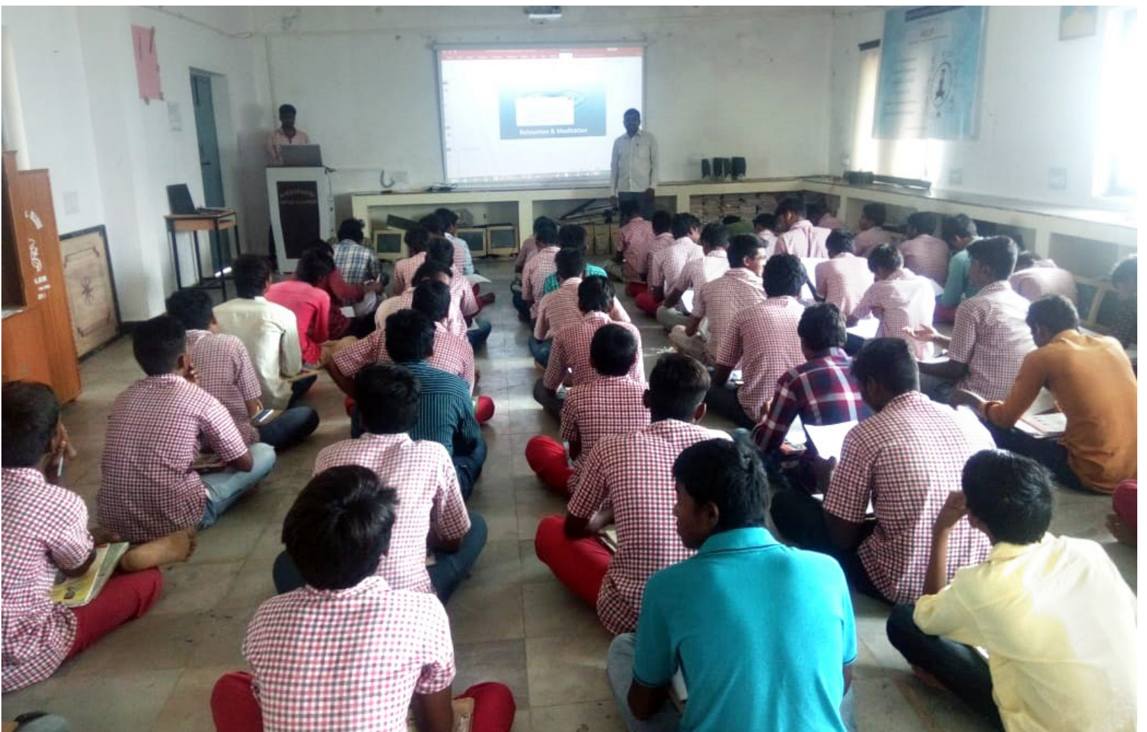
Balayogi Gurukulam, Sagileru - 70 students Dt: 8th August 2018