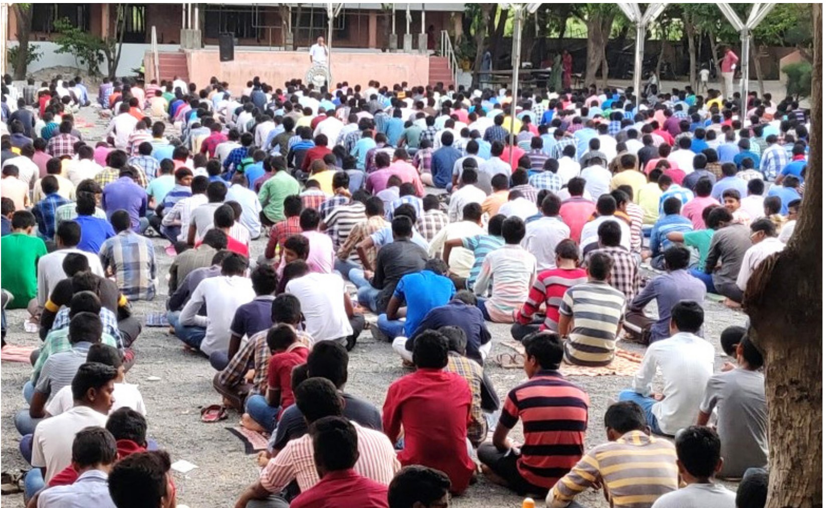
Sri Chaitanya Educational Institutions, Vikas Nagar, Guntur - 1700 students Dt: 4th August 2018