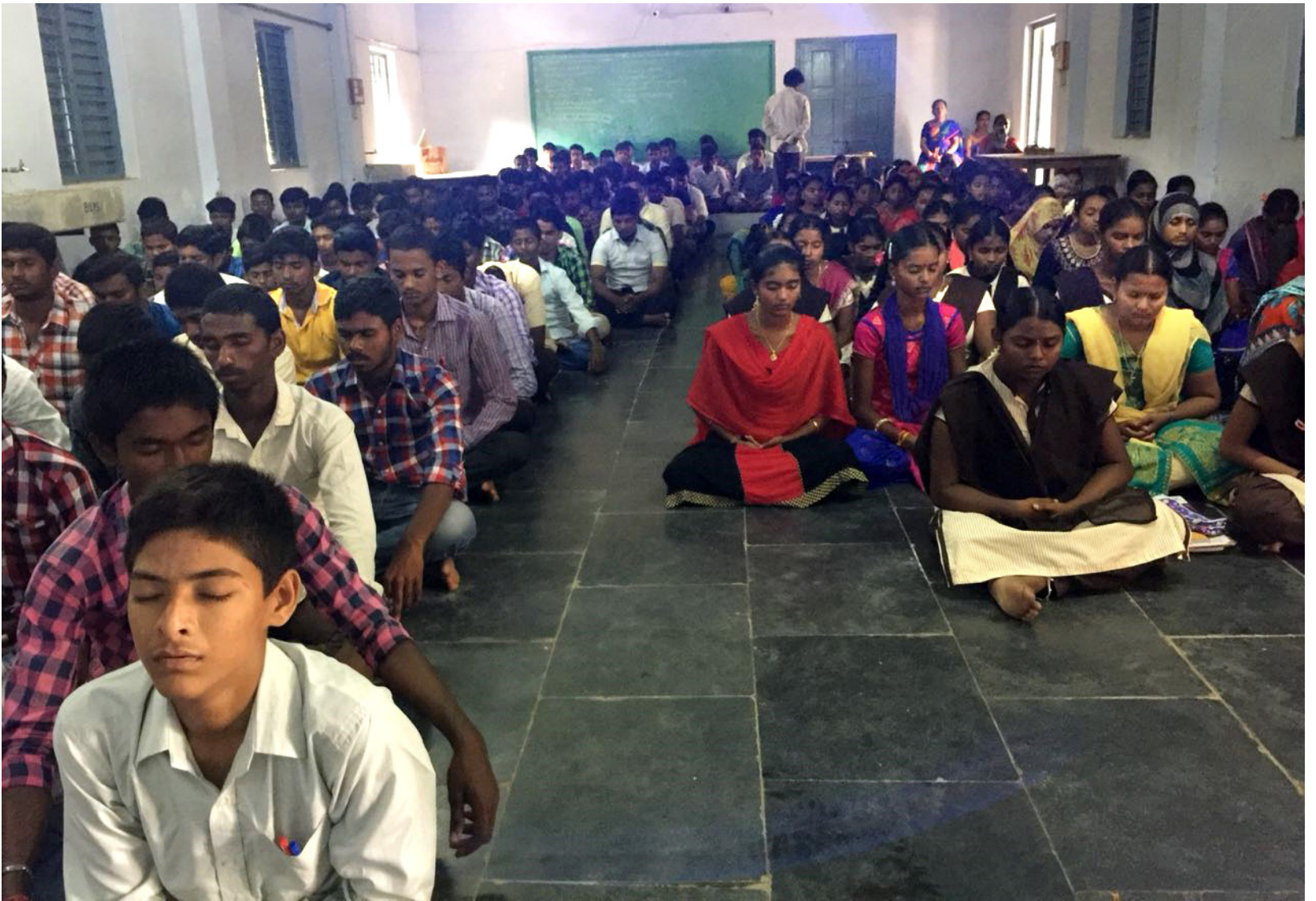
Government Junior College, Karlapalem - 250 students Dt: 4th August 2018