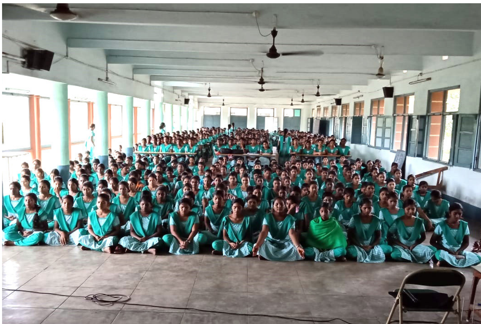
Ch SD St. Theresa Junior College, Eluru - 1346 students Dt: 10th August 2018