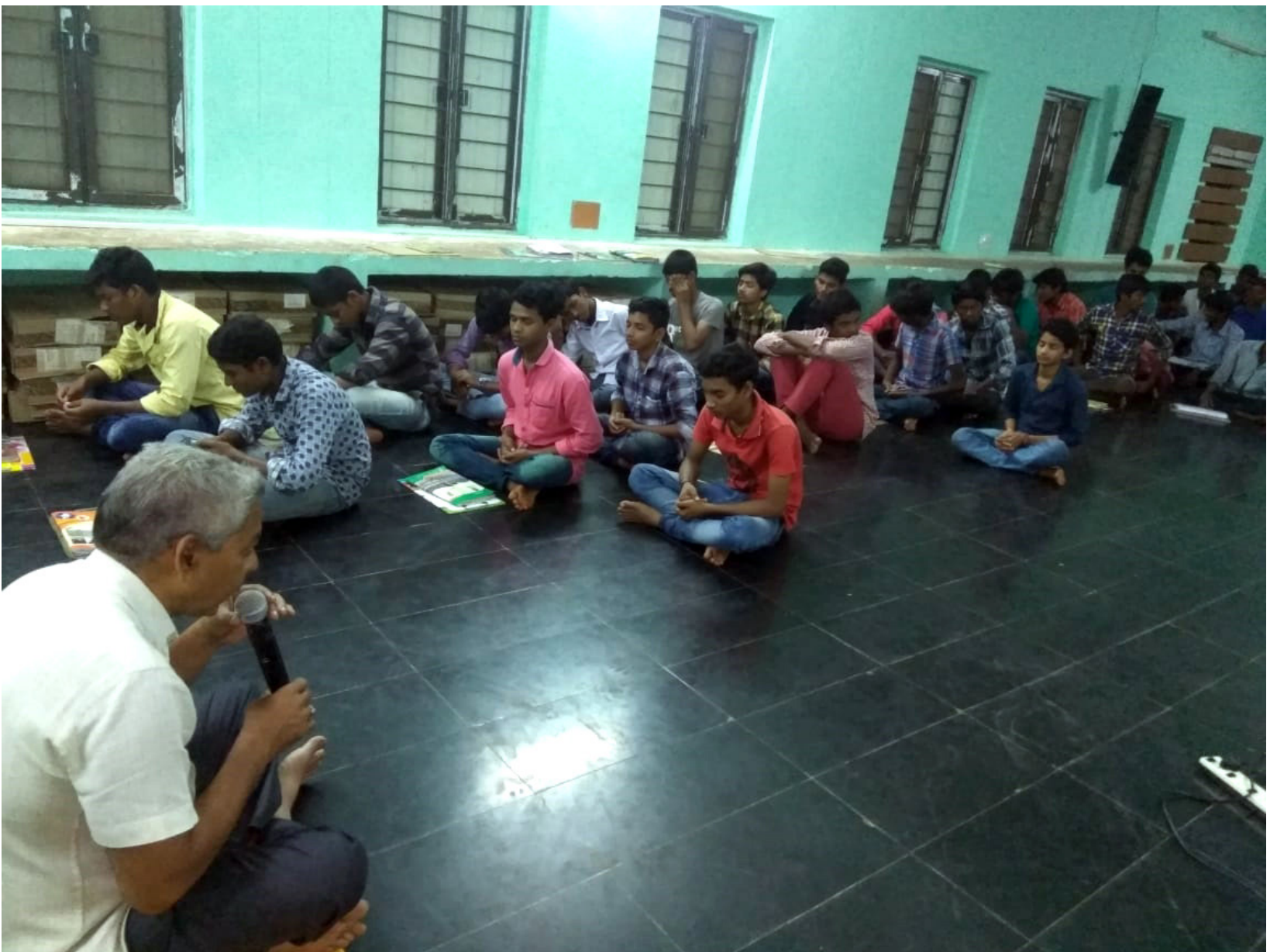
APSWR Junior College, Boys, Godi Village - 125 students Dt: 11th August 2018