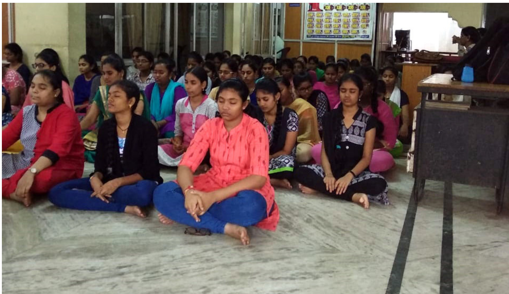
Sri Chaitanya IIT Foundation, Visakhapatnam - 600 students Dt: 7th August 2018