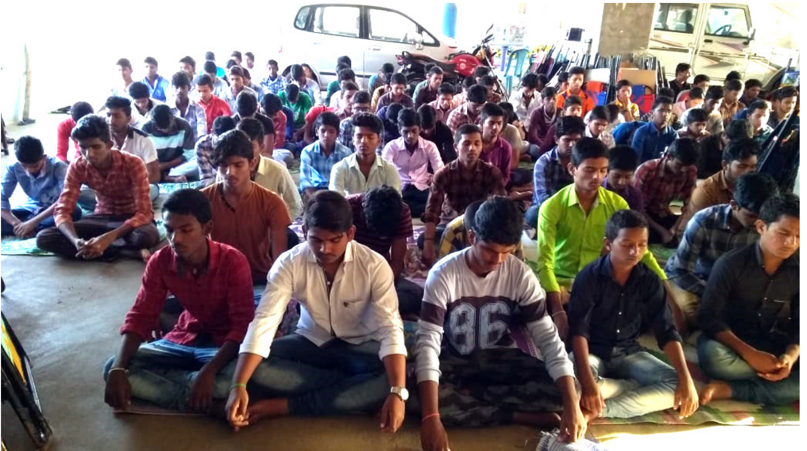
Sai Cooperative College, Kavali- 139 students Dt: 20th August 2018