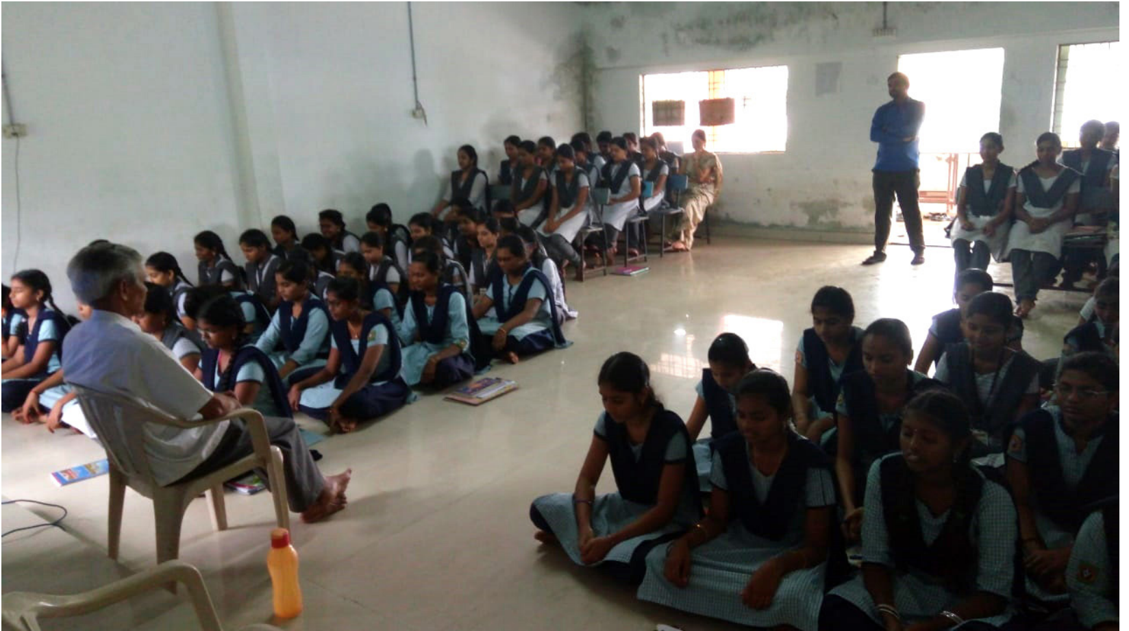
Gayathri Junior College, Tatipaka - 185 students Dt: 13th August 2018