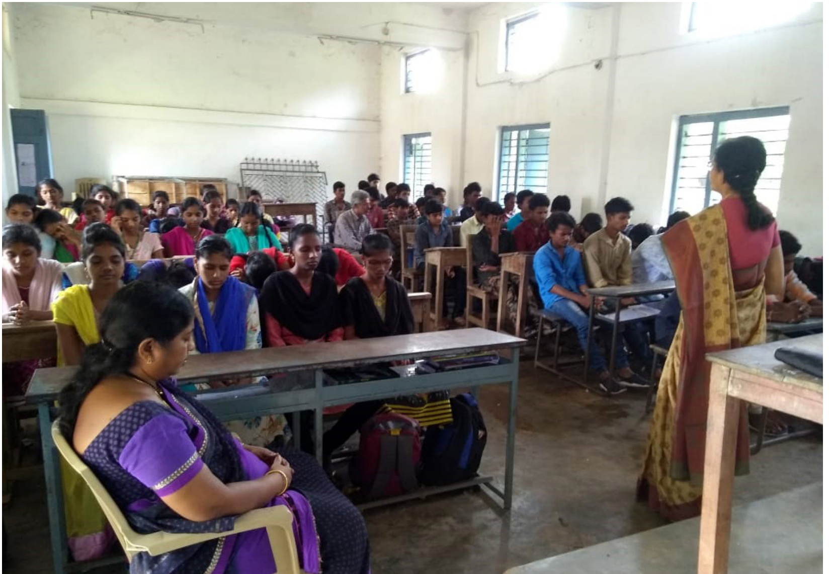
Government Junior College, Yendagandi - 66 students Dt: 8th August 2018