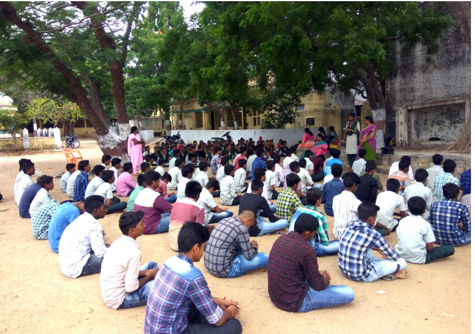
BSK Government Junior College, Chittoor - 168 students Dt: 10th August 2018