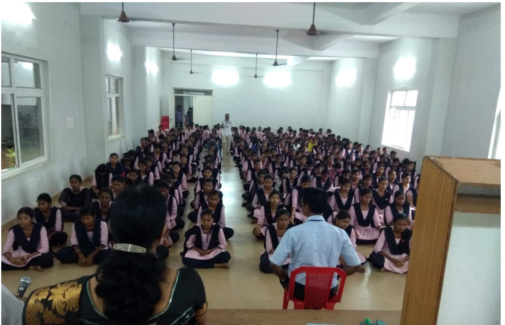
Alwardas Junior College, Visakhapatnam - 256 students Dt: 7th August 2018