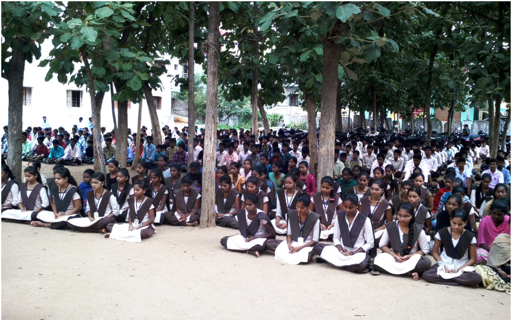
Vivekananda Junior College, Kalyanadurgam - 800 students - Dt: 10th August 2018