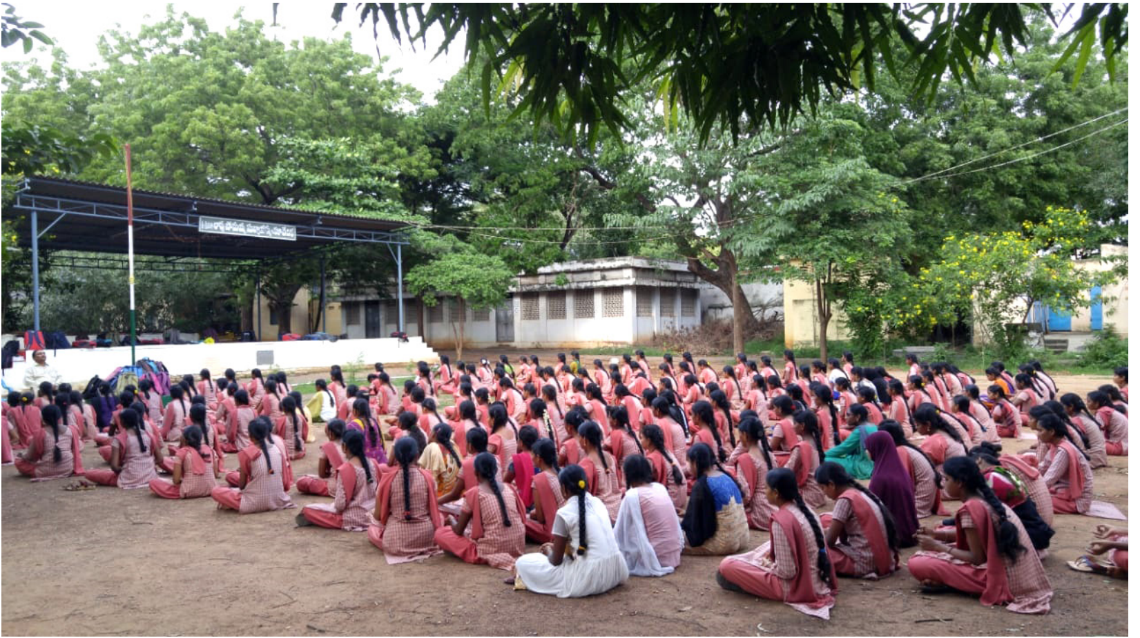
Government Junior College, Girls, Guntur - 800 students Dt: 20th August 2018