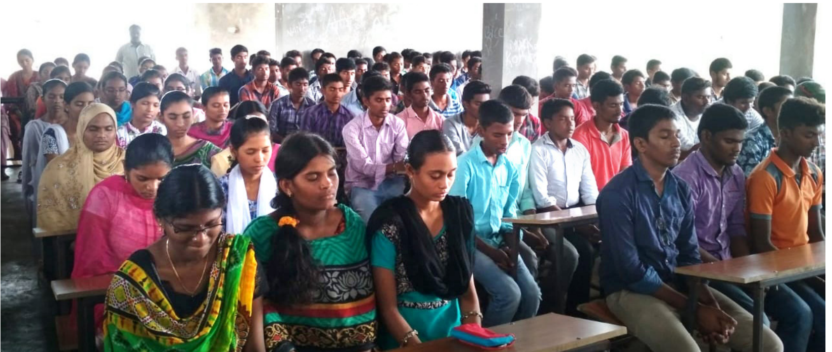
Pragathi Junior College, Komarole - 260 students Dt: 6th August 2018