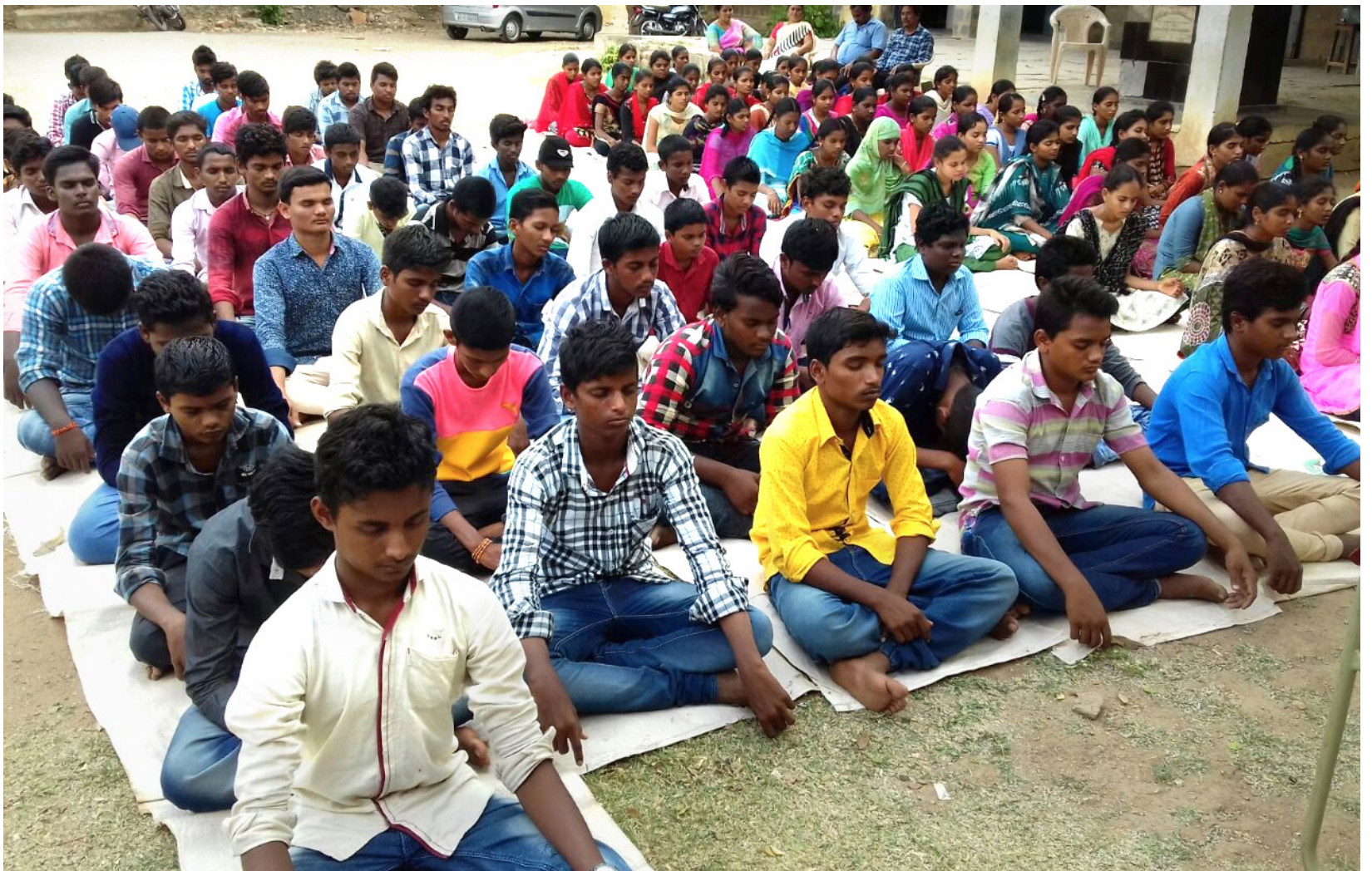
KY Government Junior College, Maddipadu - 125 students Dt: 4th August 2018