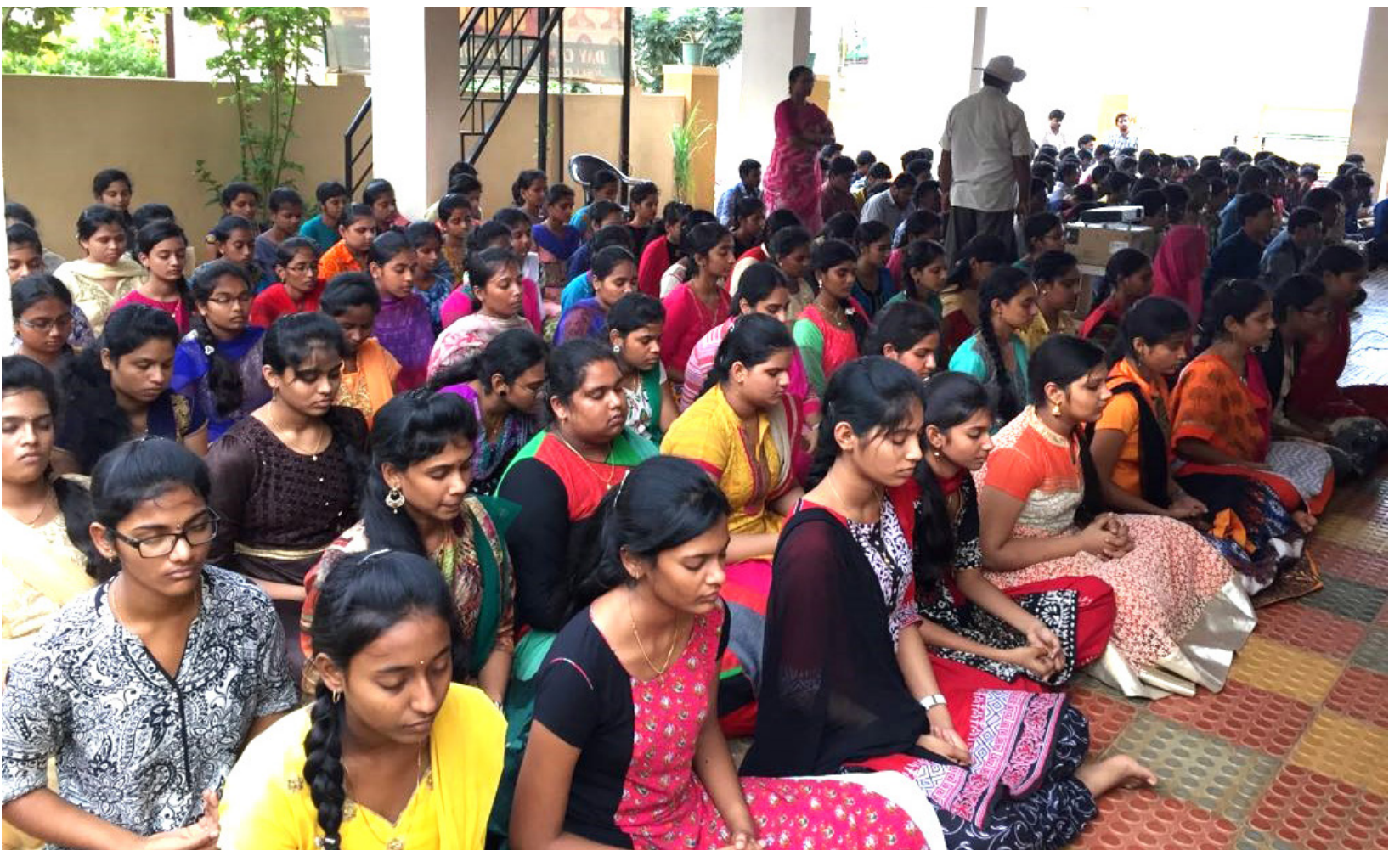
Sri Gayathri Junior College, Magunta Layout, Nellore - 200 students Dt: 3rd August 2018