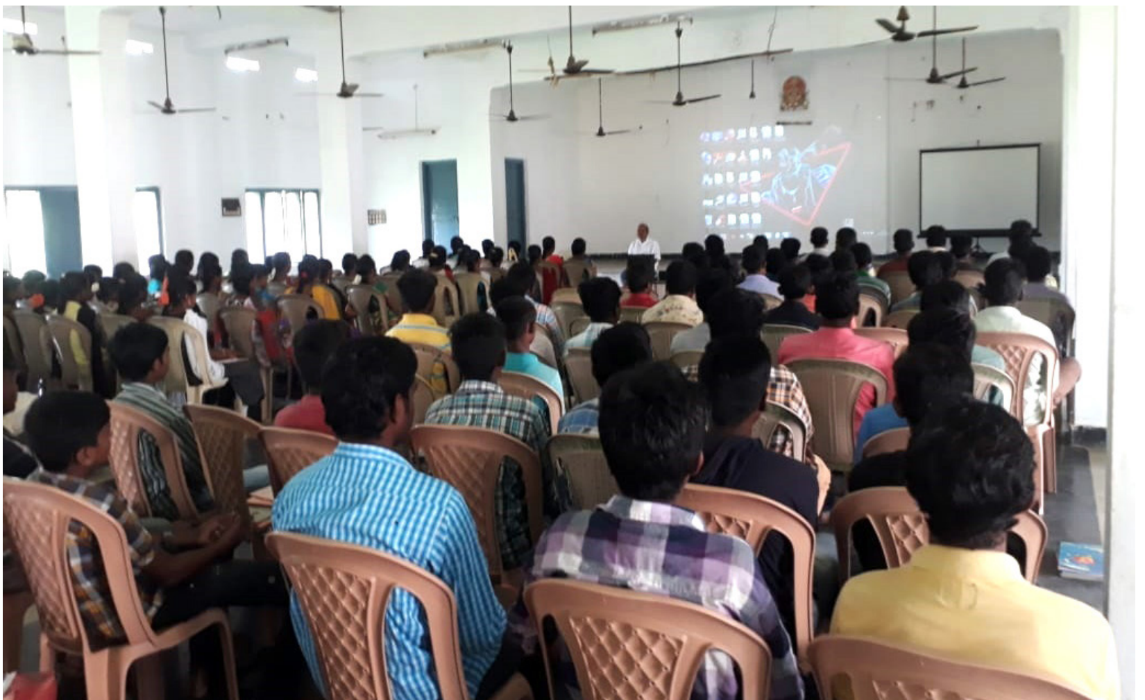
Government Junior College, Pedapadu - 98 students Dt: 7th August 2018