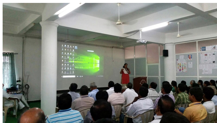
Training Sessions at Ongole Heartfulness Centre - 7th & 8th July 2018