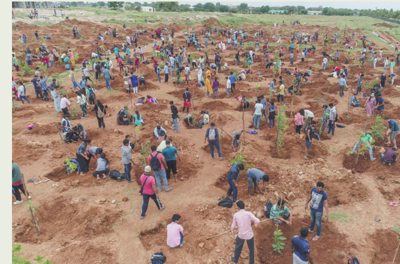
Volunteering at Kanha Shanti Vanam