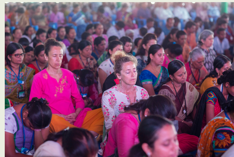
Where the world meditates