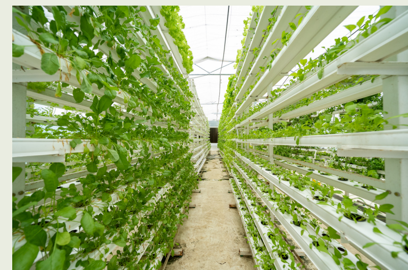
Many Agritech innovations