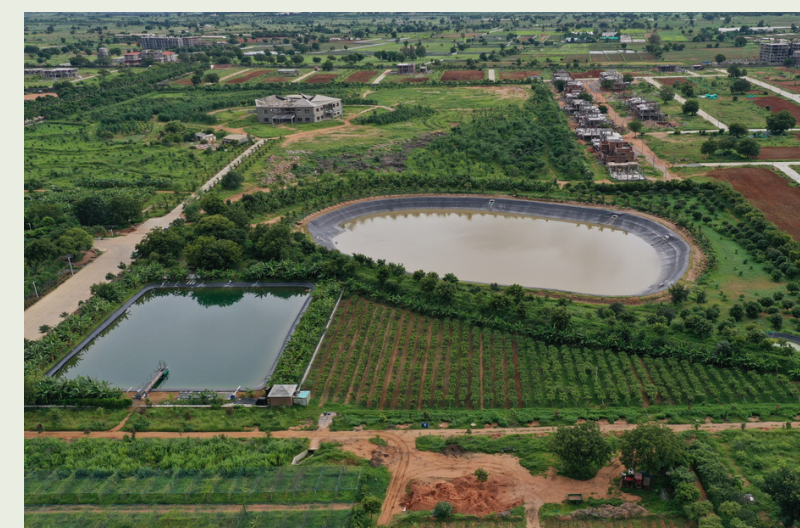
Green and Blue projects