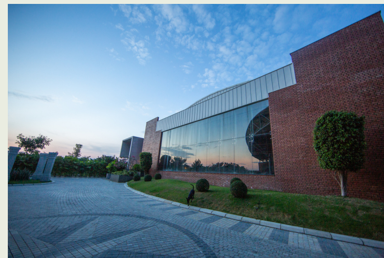
Conference and auditorium center