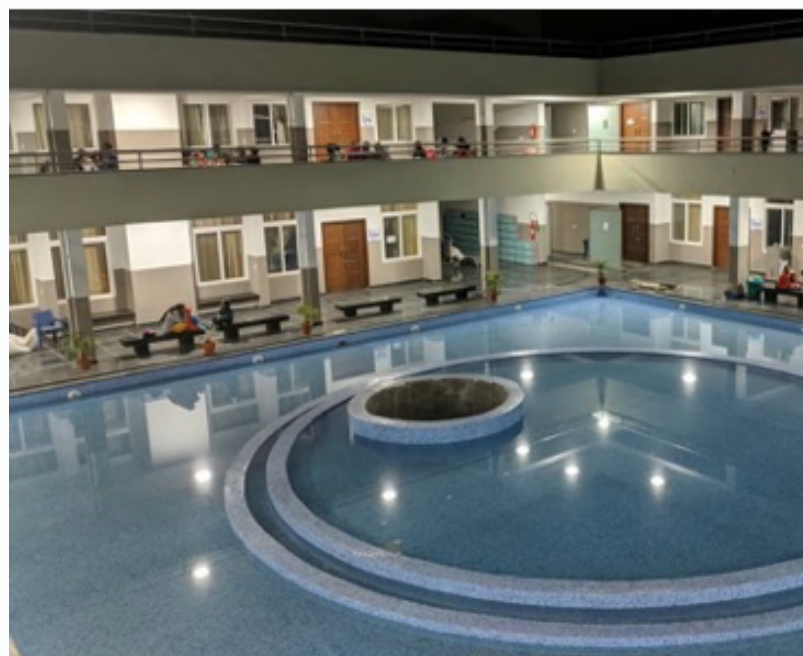
COMMON AREA IN THE DORMITORIES