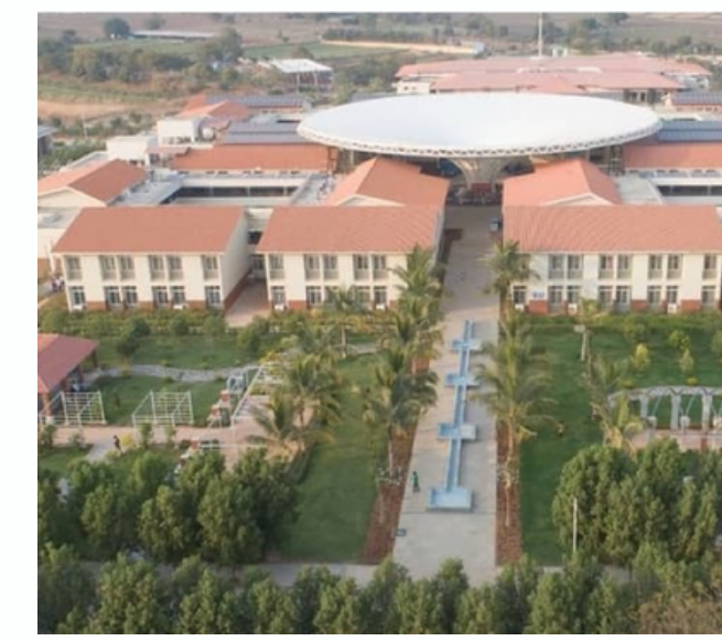
EXTERIOR VIEW OF DORMS (5K CAPACITY)