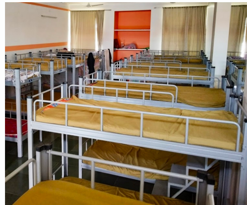
AC AND NON-AC COMFORT DORMITORIES