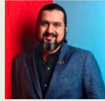
Rickey Kej Music Composer and Two Time Grammy Awardee