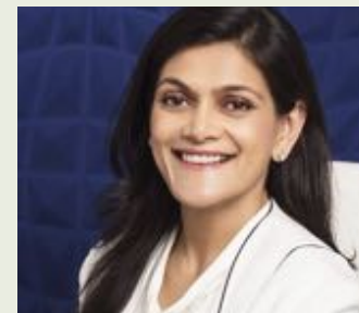
Neerja Birla Educationist & Mental Health Activist