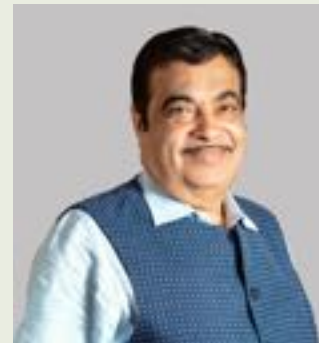
Nitin Gadkari Union Minister of Road Transport & Highways