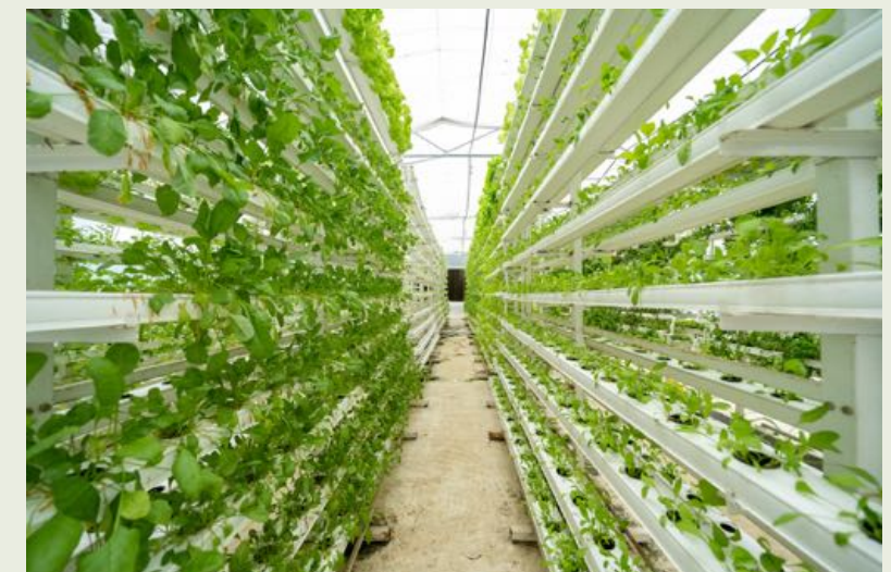
Many AgriTech innovations