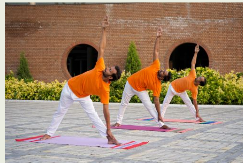
International Yoga Academy