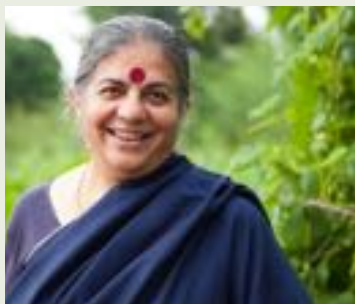
Vandana Shiva Environmental Activist