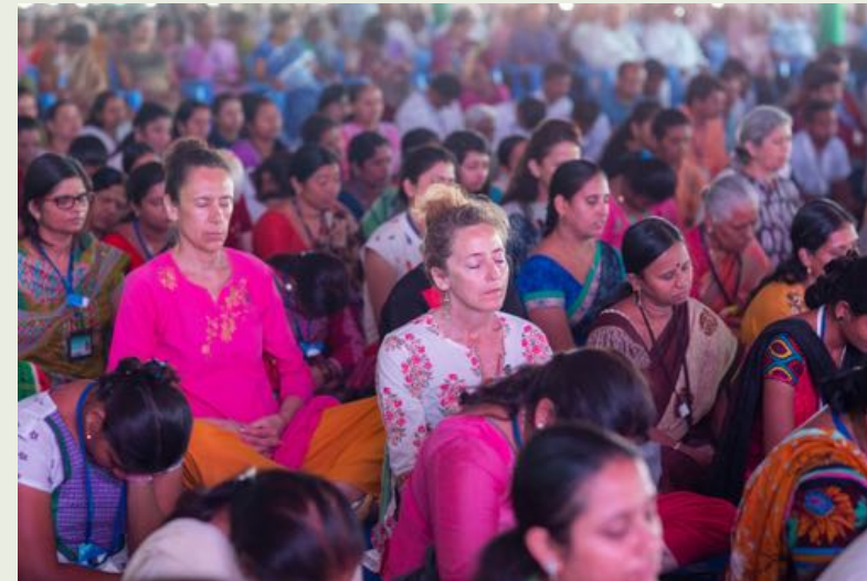
Where the world meditates