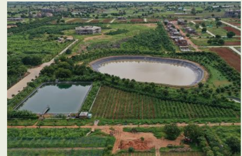
Green and Blue projects