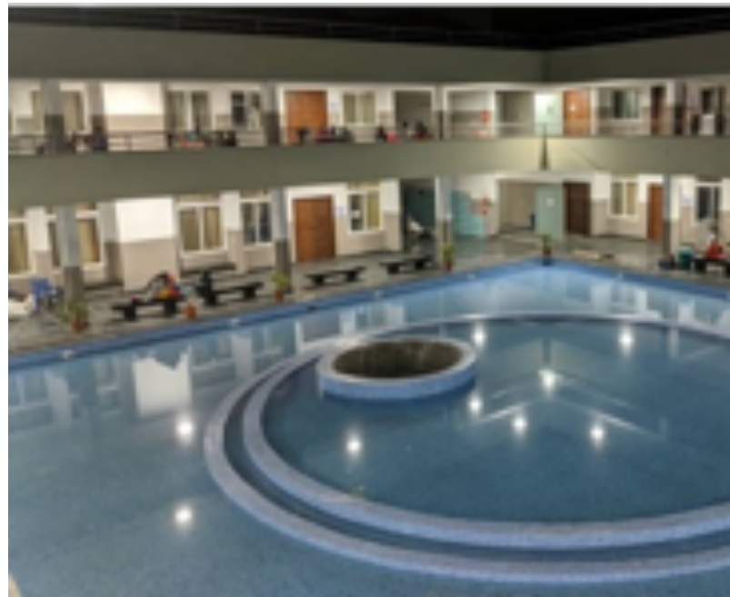
COMMON AREA IN THE DORMITORIES