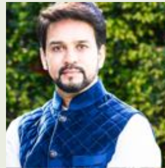
Anurag Thakur Union Minister of Youth Affairs and Sports