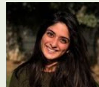
Tanya Maniktala Indian Actor