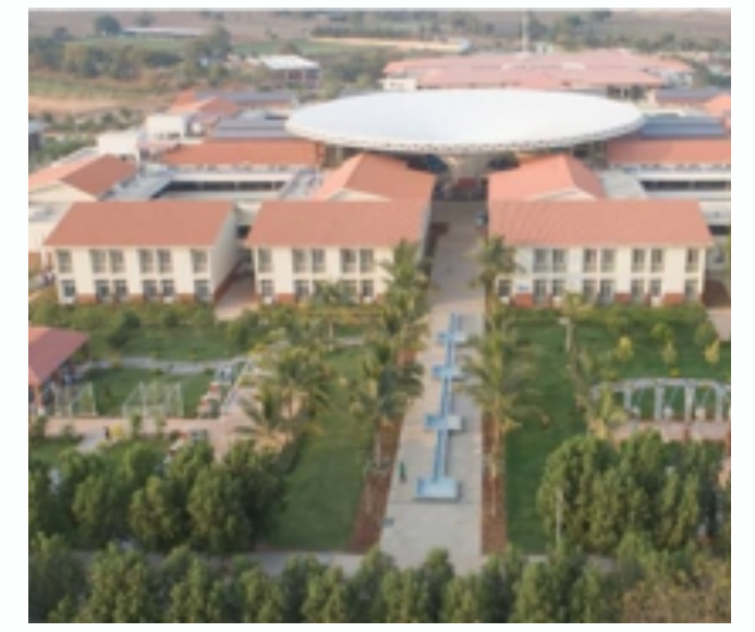
EXTERIOR VIEW OF DORMS (5K CAPACITY)