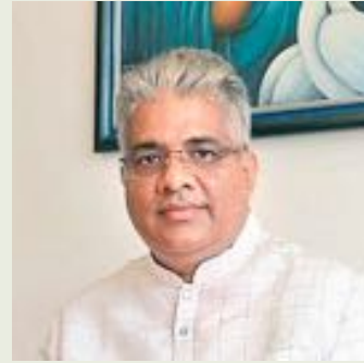
Bhupender Yadav Union Minister of Environment