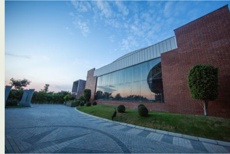
Conference and auditorium center