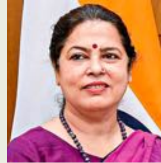
Meenakshi Lekhi Union Minister of State of External Affairs & Culture