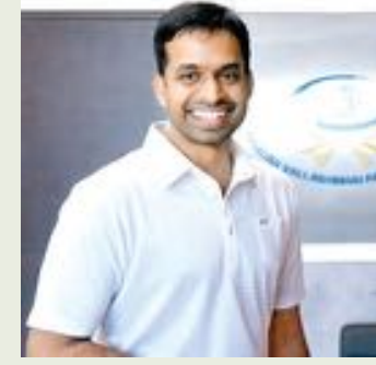
Pullela Gopichand Chief National Coach, Indian Badminton Team