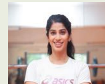
Joshna Chinappa India Professional Squash Player