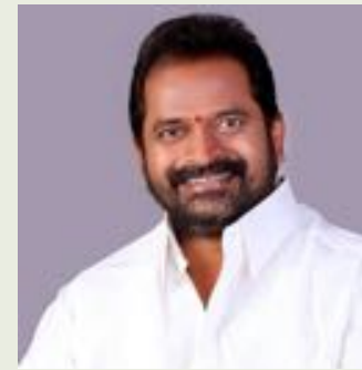
V. Srinivas Goud Minister of Sports & Youth services, Tourism & Culture and Archaeology, Telangana