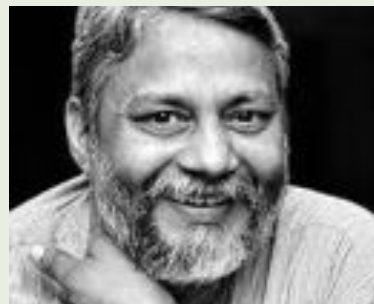
Rajendra Singh Waterman of India