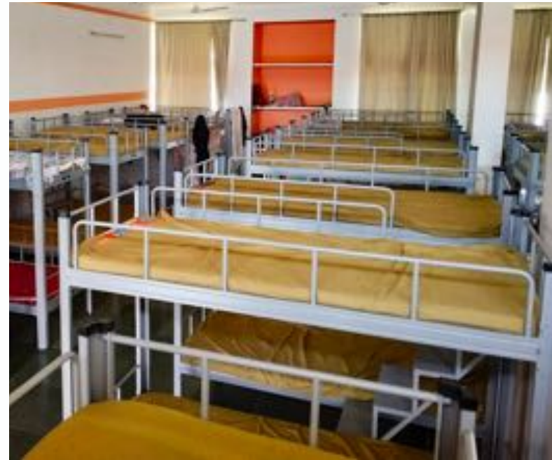
AC AND NON-AC COMFORT DORMITORIES