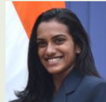
P V Sindhu World Champion and Badminton Player