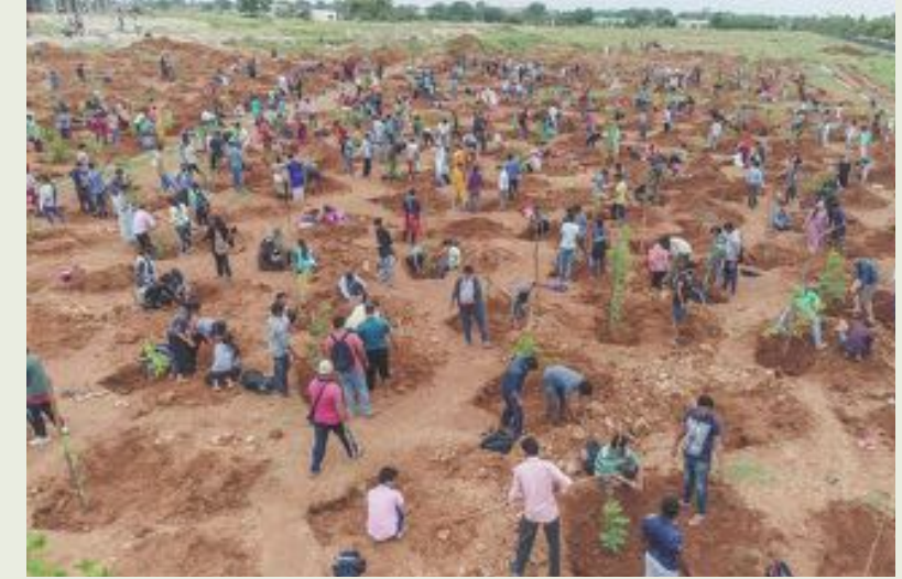
Volunteering at Kanha Shanti Vanam