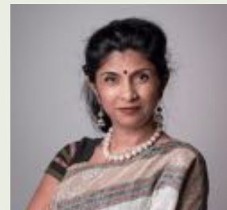
Vani Kola Venture Capitalist